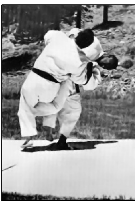
required to get the feel of the counter, because the foot will be placed a little differently for each attacker.