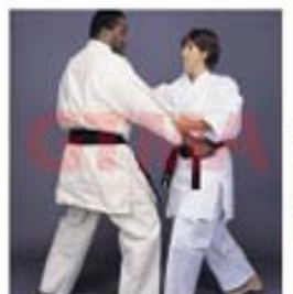
GTMA Judo Gi; Double Weave, Natural $50.00