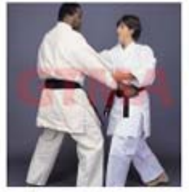
GTMA Judo Gi; Single Weave, Natural $25.00